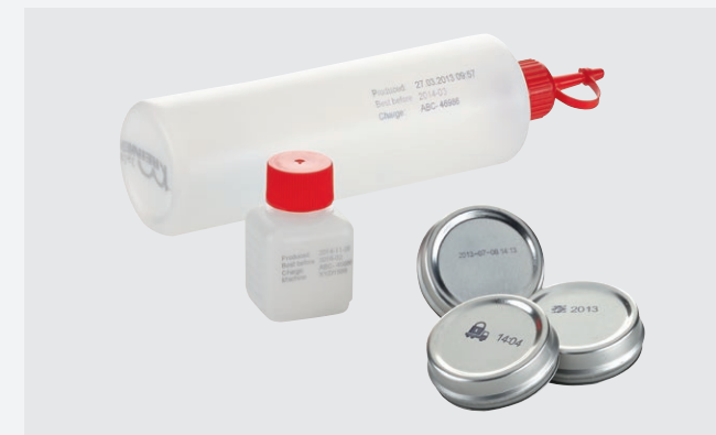
Printing with quick drying ink on metal and plastic (Version MP).